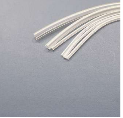
MEDICAL GRADE PVC TUBING (DOP & NON-DOP)