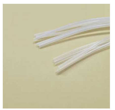
MEDICAL GRADE TPE & TPU TUBING